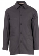
IRON GREY 13067